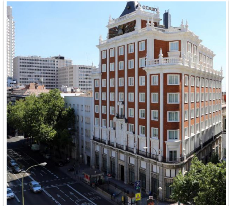
Ocaso Head Office (Madrid, Spain)

Ocaso is committed to delivering quality insurance products and service levels to brokers and policyholders alike.